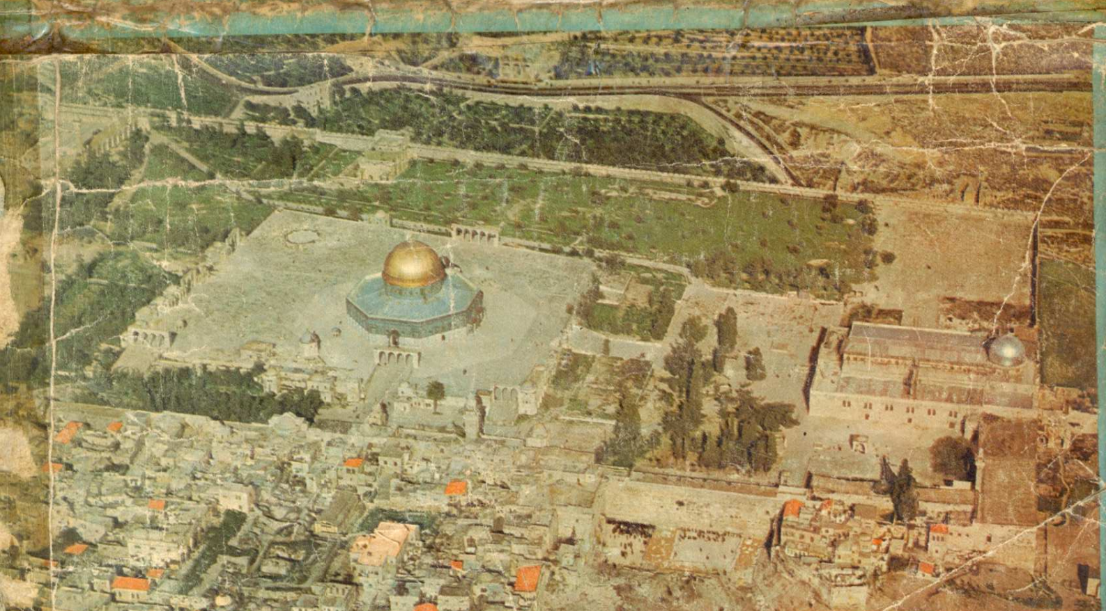
Jerusalem. The Old City from the air. From here He commanded blessings, even life forevermore. He hath chosen ZION. He hath desired it for His habitation. "Here will I dwell". — Psalms 132: 15, 14, and 133: 3.